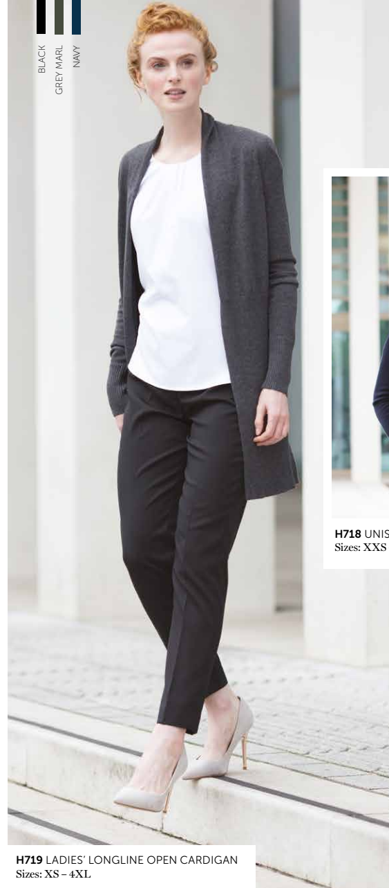
H719 LADIES' LONGLINE OPEN CARDIGAN Sizes: XS - 4XL