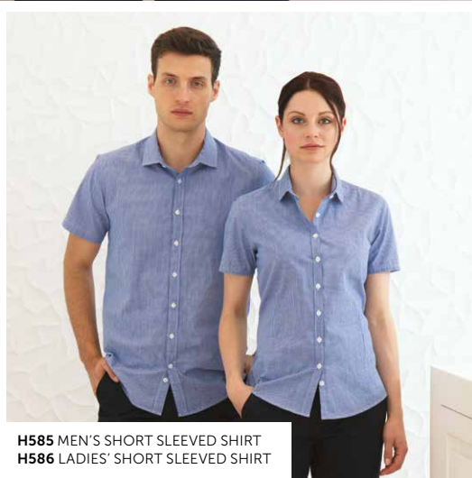
H585 MEN'S SHORT SLEEVED SHIRT H586 LADIES' SHORT SLEEVED SHIRT