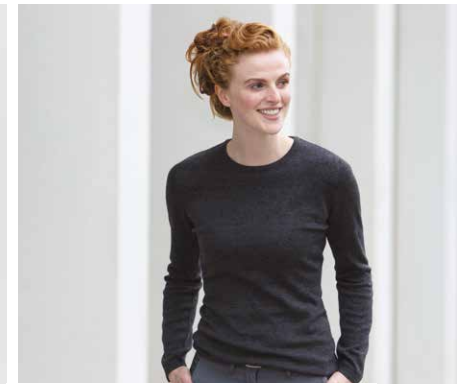
H728 LADIES' CREW NECK JUMPER Sizes: XS - 2XL