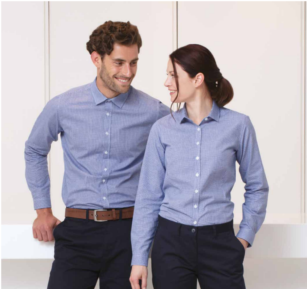
H580 MEN'S LONG SLEEVED SHIRT H581 LADIES' LONG SLEEVED SHIRT