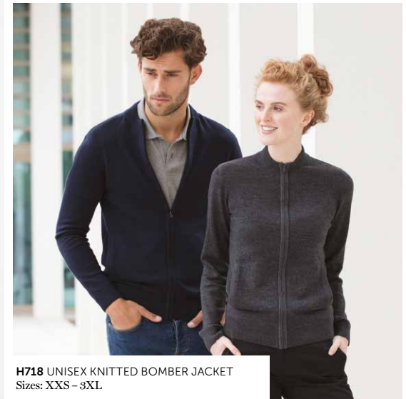
H718 UNISEX KNITTED BOMBER JACKET Sizes: XXS - 3XL